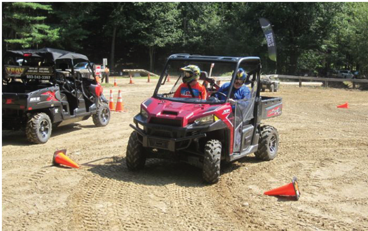
The Michigan DNR hosted the National Off-Highway Vehicle Conservation Council in late August 2018, bringing together hundreds of ATV, dirt bike and ORV enthusiasts from across the country. One of the on-site tours was held in Lake County, near Baldwin (shown here), where this ORV was used to give tours.