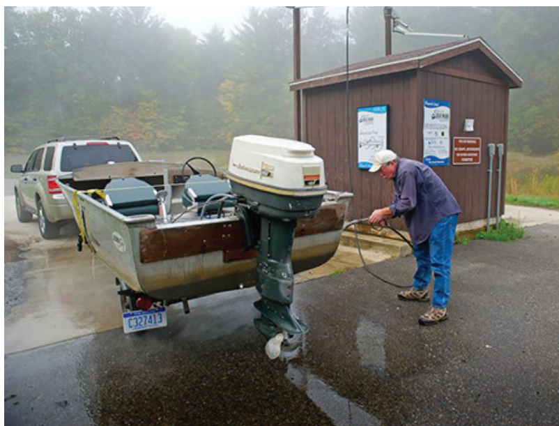
With new laws that took effect March 21, watercraft users in Michigan are required to take steps to prevent the spread of aquatic invasive species. These steps include cleaning, draining and drying boats and equipment as well as disposing of unwanted bait in the trash.

With new laws that took effect March 21, watercraft users in Michigan are required to take steps to prevent the spread of aquatic invasive species. Also, anyone fishing with live or cut bait or practicing catch-and-release fishing will need to take precautions to limit the movement of invasive species and fish diseases.